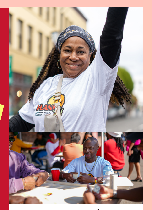
2024 Photos & Videos

Our online presence has been equally impressive, with the i-Land Fest website receiving over 20,000 hits in the weeks leading up to the event. This surge in traffic underscores the widespread interest and excitement surrounding the festival, making it an excellent opportunity for sponsors to reach a diverse and engaged audience.